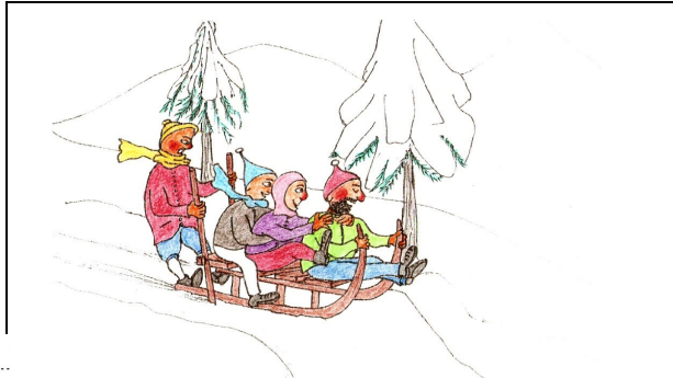
Maibaum Aufstellen - May Pole Raising