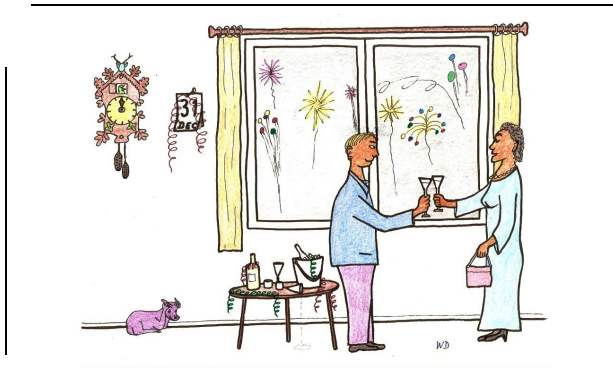
Steinheben Starkbierfest - Stone Lifting Strong Beer Festival