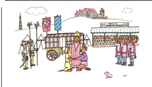
Hornschlitten Rennen - Horn Sledge Race